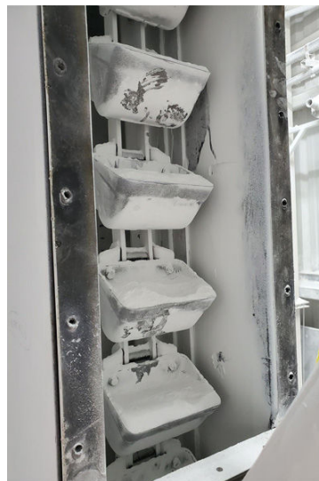
Calcium Carbonate was Ultra-Fine and Causing a Suction Effect in Buckets