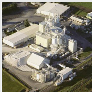
Columbia River Carbonates Provides High-Grade Calcium Carbonate to Many Industries