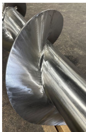
Every Surface is Polished to 150-Grit Finish