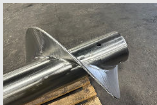
Flight to Pipe Welds are Continuous on Both Sides