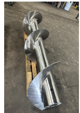
ASME Certified Welders Perform All Welds