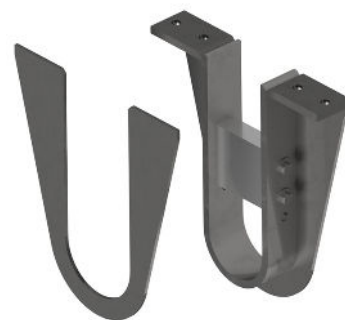
Exploded View of Hanger Design