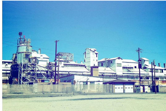
Searles Valley Minerals Makes Borate Products for Industrial Use