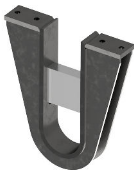
New KWS Hanger Eliminated Downtime and Increased Profitability

"Thank you to KWS for solving a lasting problem at our plant. We have wasted countless hours over the last several years replacing failed hangers. The KWS solution will more than pay for itself within 60 days."