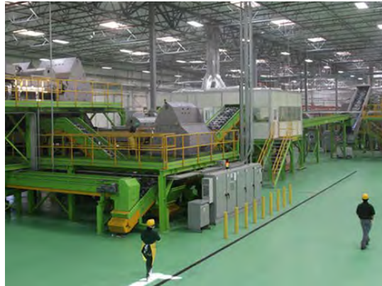
Plastic Bottle Recycling Reduces Waste and Carbon Footprint