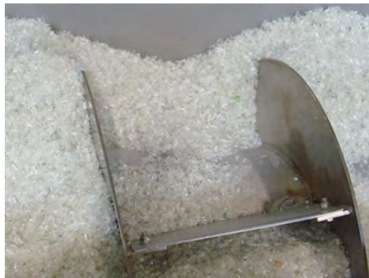
PET Flake is Washed and Conveyed by KWS Screw Conveyor