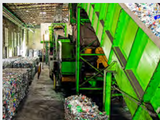
Bales of Used Plastic Bottles Arrive at Recycle Facility for Sorting and Processing