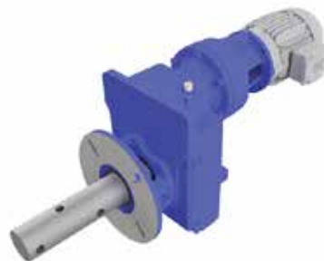
C-Face Adapter Allows Use with Customer Specified Motor