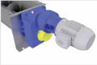
Sumitomo Parallel Shaft BuddyBox Combines Cyclo Input with Helical Gear Output