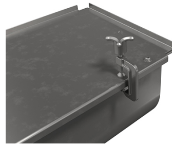
Two Safety Bolts are Provided for Each Cover