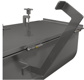
Backstop Provides Secure Resting Position for Covers