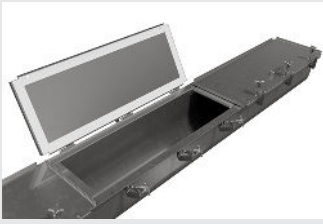
Hinged Covers Allow Easy Access for Cleaning and Maintenance