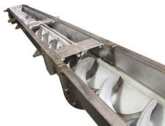
KWS Shaftless Screw Conveyor with UHMW Liner

KWS can also replace liners from other conveyor manufacturers. All we need to know is the screw conveyor diameter, liner material and thickness, liner length, and distance liner extends above the roll line. Most liner lengths are the full length of the trough section if the liner material is metal. UHMW liners are typically 4-feet in length.