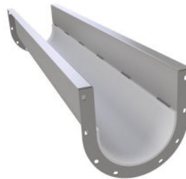
KWS U-Trough with UHMW Liner in Place