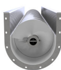
Extending Liner 1-Inch Above Roll Line Provide Superior Performance