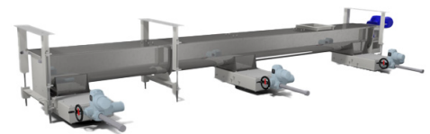
KWS Standard Support Design Makes Design, Analysis, Manufacturing, and Installation Easy