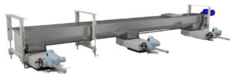
KWS Standard Support Design Makes Design, vAnalysis, Manufacturing, and Installation Easy