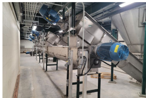
Typical Floor and Hanging Supports for Screw Conveyors in Field