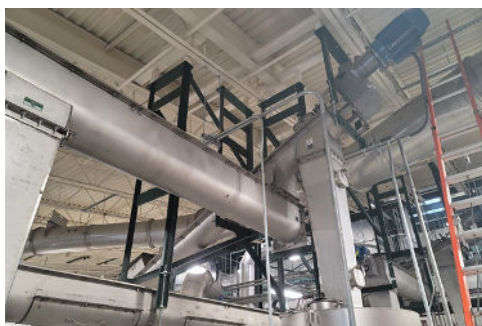
Hanging Supports are Adjustable in Field to Compensate for Variations in Building Dimensions