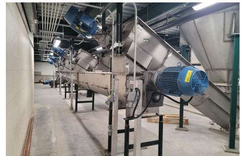
Typical Floor and Hanging Supports for Screw Conveyors in Field