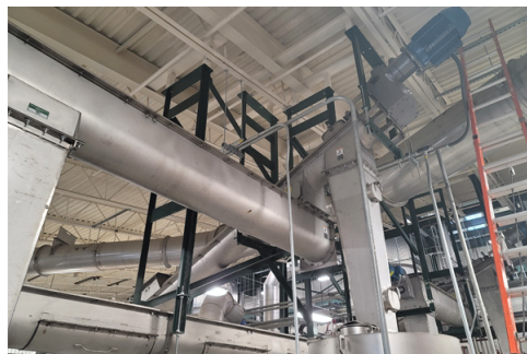
Hanging Supports are Adjustable in Field to Compensate for Variations in Building Dimensions