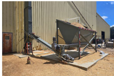
KWS Provides Complete Bulk Material Handling Systems for Every Process

Learn more at https://www.kwsmfg.com/industries/ . KWS can help you solve even the most complex bulk material handling problems. Our team of experienced professionals has solved thousands of bulk material handling problems for over 50 years. Please contact KWS today!!