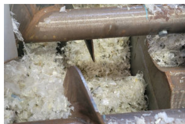
KWS Screw Feeders are Used to Recycle Waste Plastic to Reduce Landfill Space