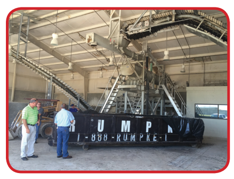
Before: Existing conveyor with only one discharge point overfilled one dumpster causing spillage and housekeeping issues.