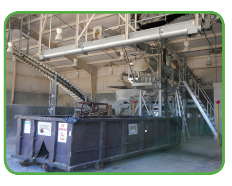
After: New KWS reversible screw conveyor has two discharge points for multiple dumpster loading and redundant operation.