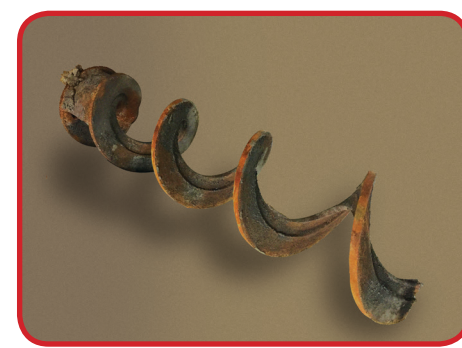
Before: Existing low strength carbon steel shaftless spiral weakened within 2 years and failed.