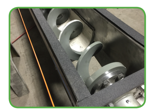
After: New high-strength KWS-350 shaftless spiral has a typical working life of over 10 years.